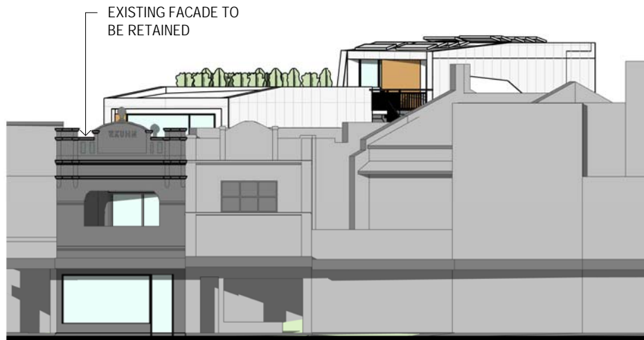
3 WEST ELEVATION - BELMORE ROAD

DEVELOPMENT APPLICATION 331/2019 Randwick City Council 1 September 2020 Records Received